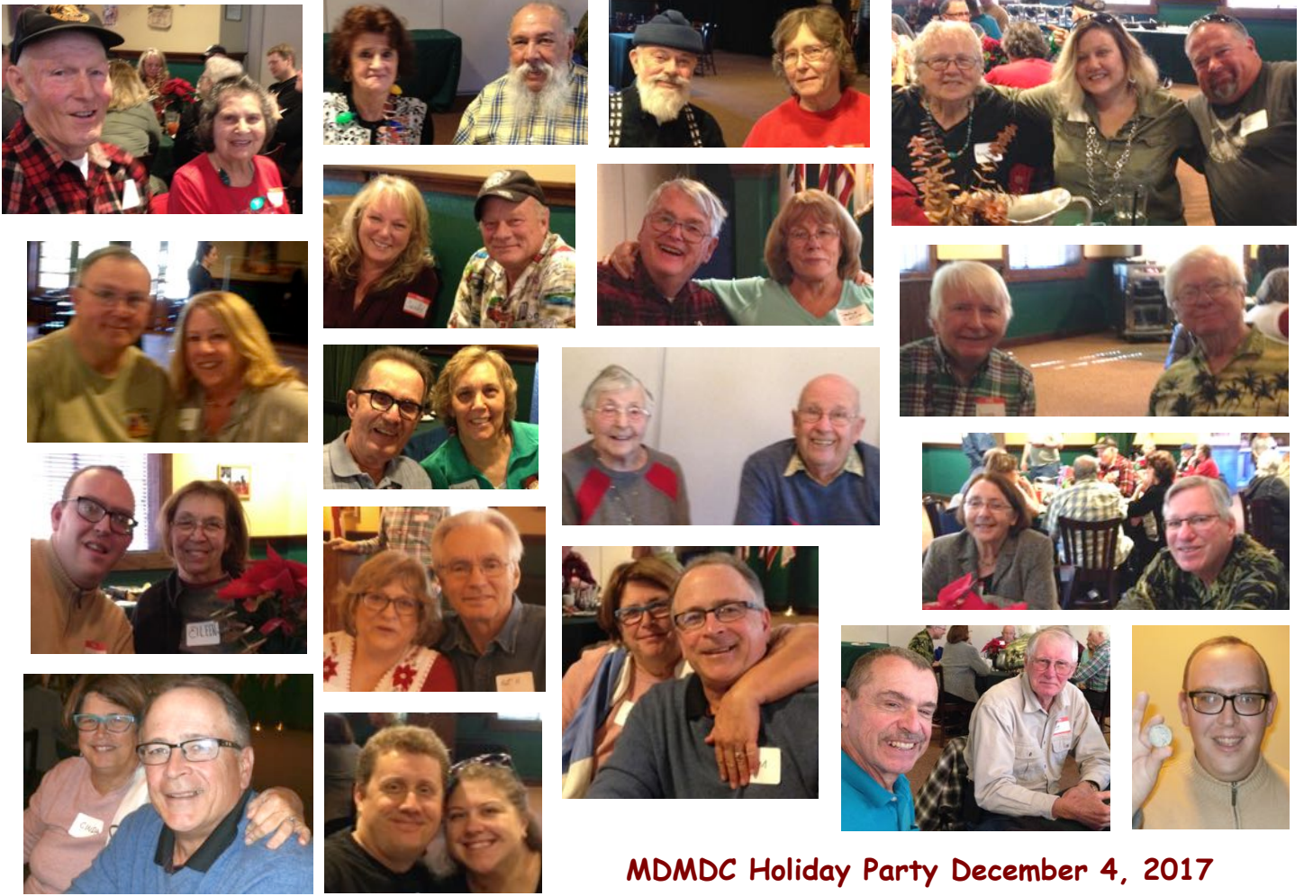
MDMDC Holiday Party December 4, 2017